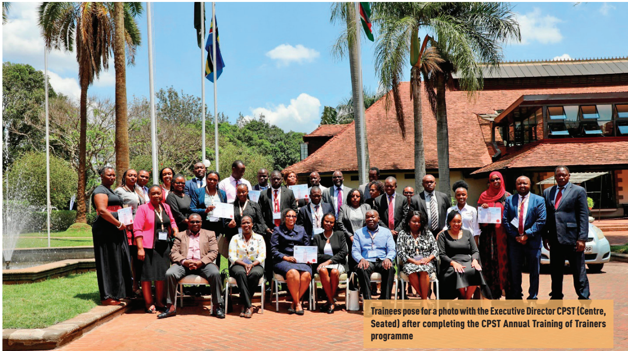
Trainees pose for a photo with the Executive Director CPST (Centre, Seated) after completing the CPST Annual Training of Trainers programme